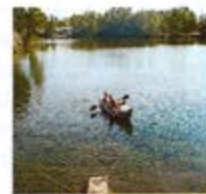
Kayaking on the Lake

The campground has 2 compost piles, one at the North side of parking lot by entrance and the other at the East End near the entrance to the Nature Path. Please only leaves and grass clipping as branches and other material won't compost yearly.