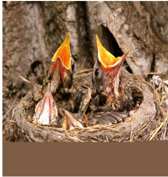
Early Spring Robins looking for their next meal.

Our hours for refills are posted at the store and at the washrooms 11AM to 5 PM. If you want your propane bottle refilled, please pay at the store then drop-off your propane bottles at the refilling station. Make sure you have your bottle marked with your lot number or name, we will not refill unidentified bottles. If we have the available staff we can possibly do it when time permits. If not available you will have to take it into town for refilling at one of the several stations that fill up propane bottles.